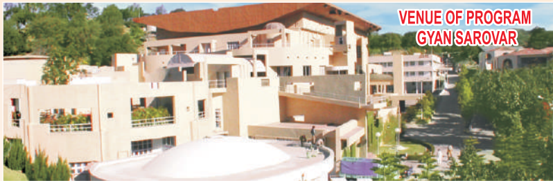
VENUE OF PROGRAM GYAN SAROVAR