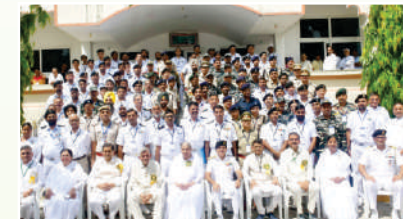
V Adm SN Ghormade, VCNS seen with Participants at BK HQ Abu Road on 23 Sep 22 during SSW Conference

SSW Motto - Victory is our Godly Birthright