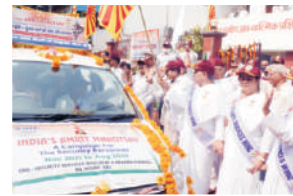
Launching of Car Campaign, Delhi, 7 Nov 21

With the onset of Corona Virus in March 2020, SSW shifted to Online programmes for the Security Forces covering Indian Army, Indian Navy, Indian Air Force, NDRF, CISF, RPF, BSF, CRPF & State Police (Kerala, UKD, MP, Raj, Delhi, Assam, Gujarat, Jharkhand etc).