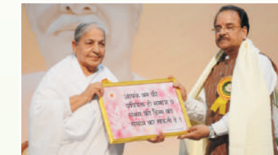
Sh Ajay Bhatt, MoS (Defence) receiving Godly Gift during SSW Program at ORC Gurgaon on 3 April 22