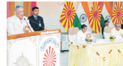
Gen Bipin Rawat, COAS addressing as Chief Guest in Pgmte at BKs HQ, Abu on 30th Dec 18