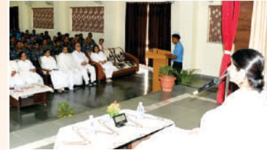
Sister BK Shivani speaking on Ever happiness to Naval officers & jawans at Naval base, Porbandar on 5 Jan 23