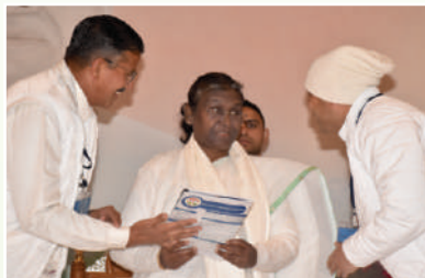
SSW Service Report of Armed Forces being presented to Hon'ble President of India Smt Droupadi Murmu at BK HQ Mt Abu on 4 Jan 23