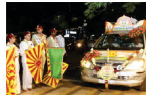
Phase III Car Campaign inauguration, Chennai, 22 June 22.

SSW Recent Projects - SSW has launched a series of Car Rallies on "Self Empowerment to Nation Empowerment" for the Security Forces Personnel as part of "Azadi ka Amrit Mahotsav" celebrations by GOI. Under this project, three car rallies were organized in Nov 21, May 22 & June 22, conducting more than 230 programs benefitting more than 42000 security personnel. Two major projects were also taken for NDRF & NSG between Oct 22 to Jan 23 covering all Bns/Hubs.