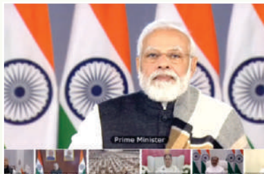
Prime Minister of India launching Project of "Azadi Ke Amrit Mahotsav se Swarnim Bharat Ki Ore" at BK HQ, Abu on 20 Jan 22