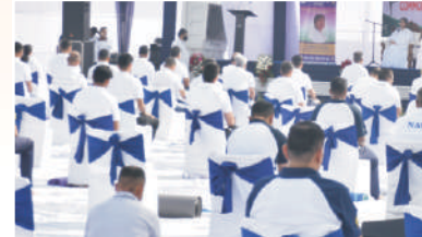
Sister BK Shivani delivering a talk during program for Coast Guards HQ personnel at Delhi on 19 May 22