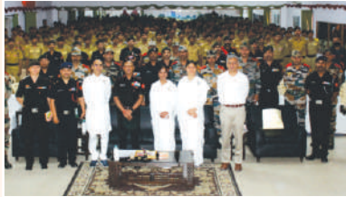
SSW faculties seen with Army officers, JCOs & Jawans after Program at Delhi on 4th April 22